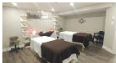
Rejuvenate Your Mind, Body & Soul

11570 Conc. 3, Zephyr 905-852-6047 uxbridgemanorandspa.com