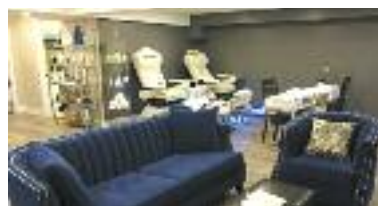
Advanced Aesthetic Treatments

Visit our day spa in Uxbridge to experience one of our treatments for yourself!