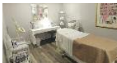
Non-Surgical Anti-Aging Treatments